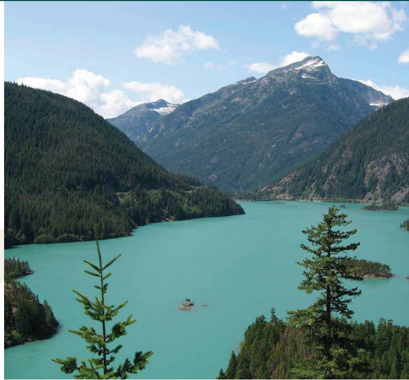
Suspended clay particles, eroded from the Cascade Mountains of Washington State, give Lake Diablo its brilliant color. The active volcanoes of the Cascades result from the subduction of the Juan de Fuca plate beneath North America.

4.6 Earth materials take many different forms as they cycle through the geosphere. Rocks form from the cooling of magma, the accumulation and consolidation of sediments, and the alteration of older rocks by heat, pressure, and fluids. These three processes form igneous, sedimentary, and metamorphic rocks.