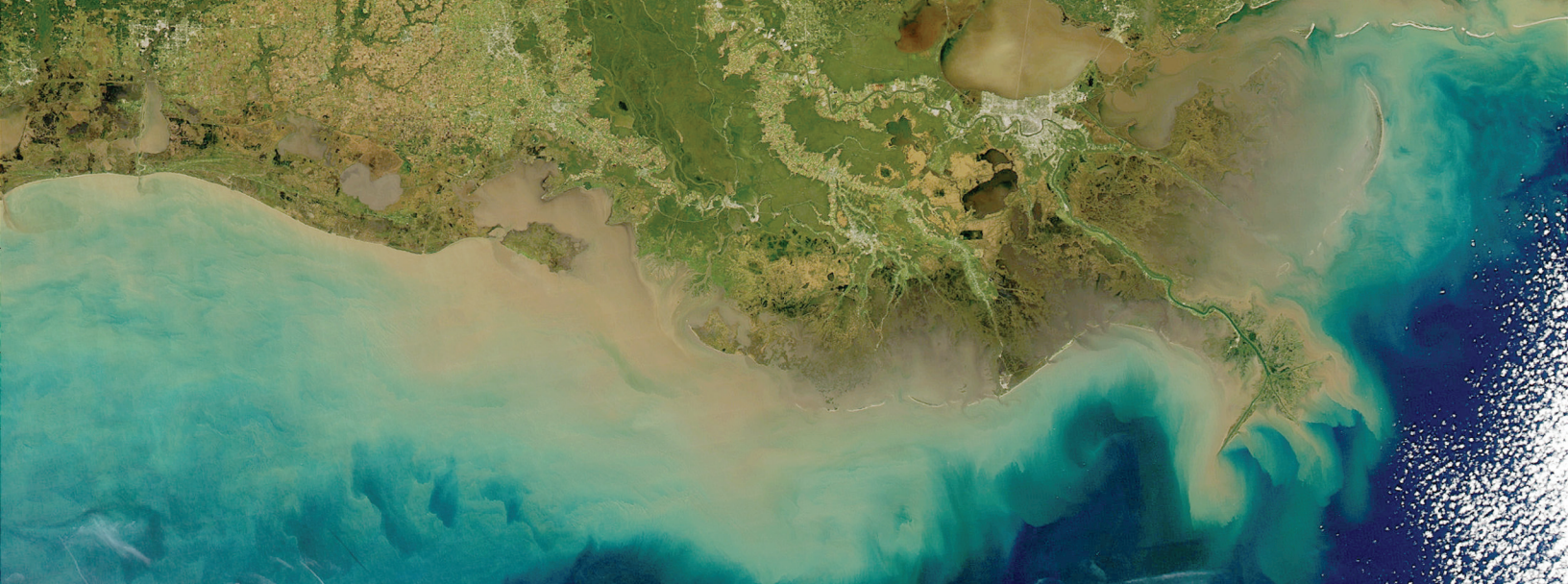
Louisiana coast with suspended sediments and organic matter flowing out of the Mississippi and other regional river systems into the Gulf of Mexico (MODIS Aqua satellite image, November 19, 2003,)