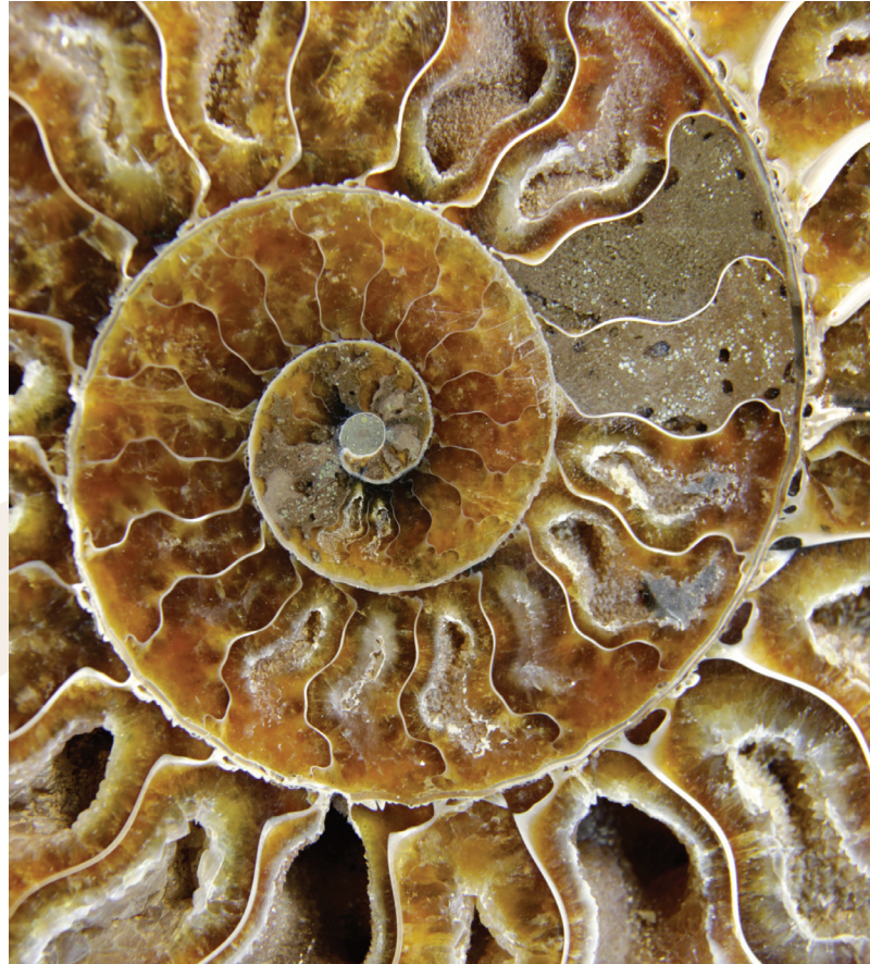
A fossil of an ammonite, an extinct ocean-living mollusk related to the modern nautilus. Ammonites evolved about 400 million years ago and were plentiful in the ocean until the occurrence of a global mass extinction > 65 million years ago that correlates with an asteroid impact.

6.7 The particular life forms that exist today, including humans, are a unique result of the history of Earth's systems. Had this history been even slightly different, modern life forms might be entirely different and humans might never have evolved.