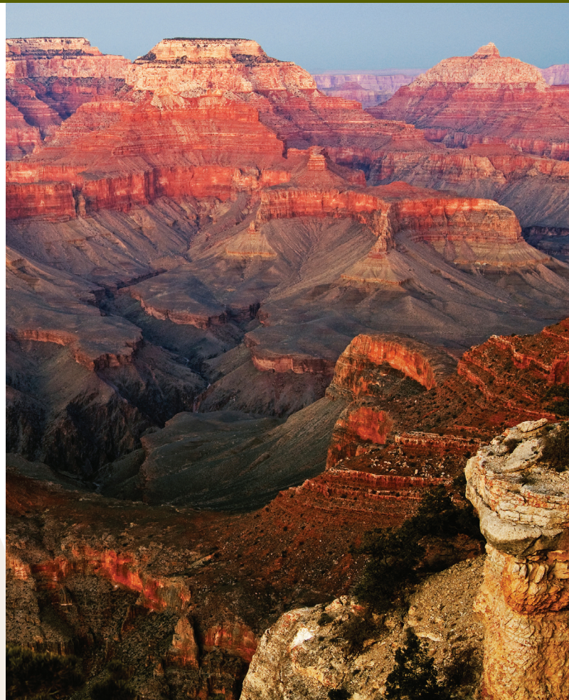
The Grand Canyon represents one of the most awe-inspiring landscapes in the United States. At the deepest parts of the canyon, nearly two-billion-year-old metamorphic rock is exposed. The Colorado River has cut through layers of colorful sedimentary rock as the Colorado Plateau has uplifted.

2.5 Studying other objects in the solar system helps us learn Earth's history. Active geologic processes such as plate tectonics and erosion have destroyed or altered most of Earth's early rock record. Many aspects of Earth's early history are revealed by objects in the solar system that have not changed as much as Earth has.